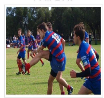
Show your support by going to this link

https://www.gofundme.com/OlCollsNZTour2017